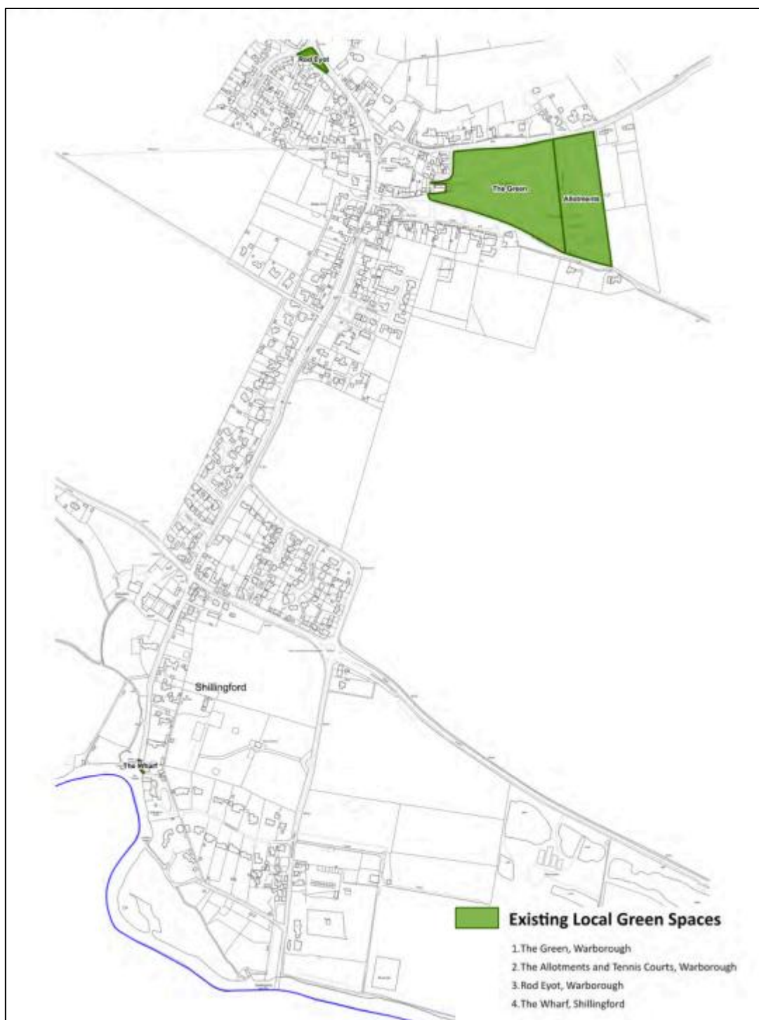
Figure 2 Existing Local Green Spaces in 2018 WSNP